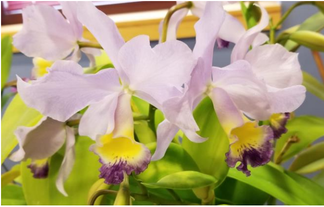
Cattleya Graniers Charm 'Hillary'