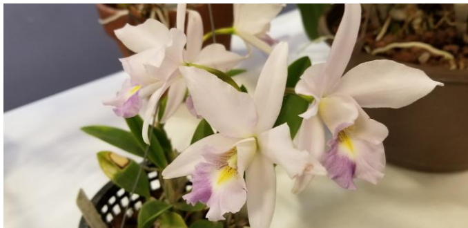
Lc Mini Purple coerulea x L anceps coerulea