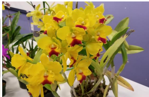
Blc Dora Louise Capen 'Lea'