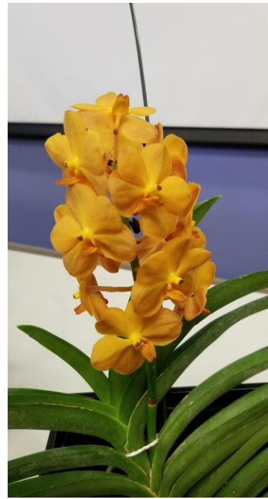
Ascda Hybrid grown by Amal Cooke