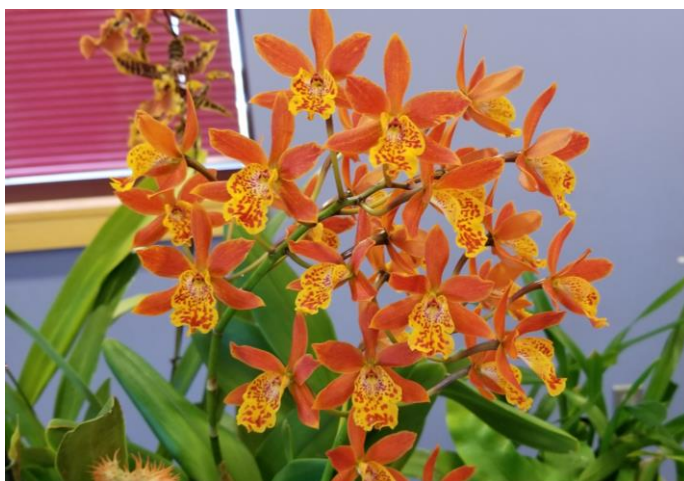
Epic Volcano Trick 'Hawaii'