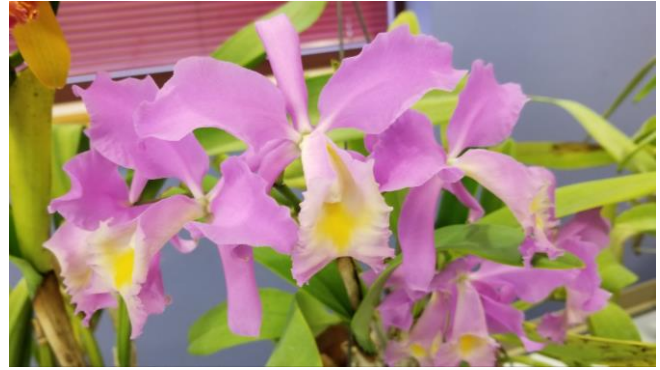
Cattleya Candy Tuft