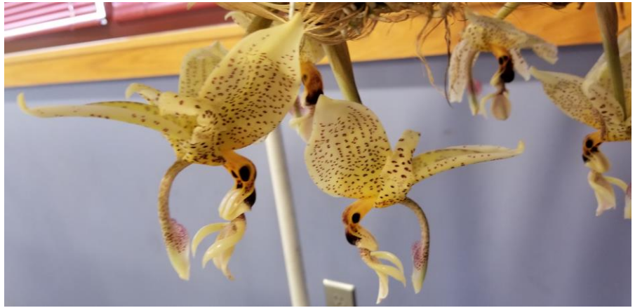
Roger's Stanhopea oculata