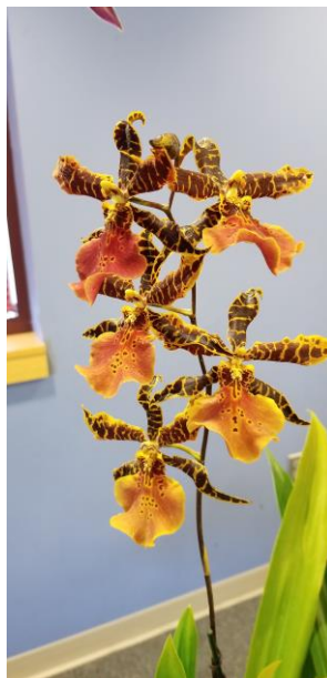
Alra Hilo Ablaze 'Hilo Gold' HCC/AOS