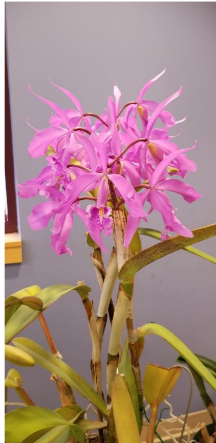
C maxima var rubra Cerro Verde 'Especial'