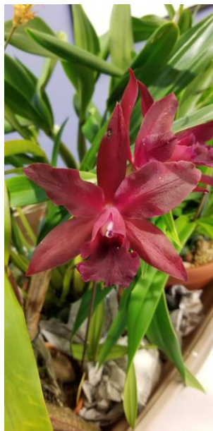
Blc Cherry Suisse 'Kauai' HCC/AOS