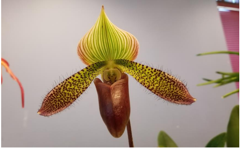
Paph Supersuk 'Eureka' AM/AOS grown by Eloise Guerriero