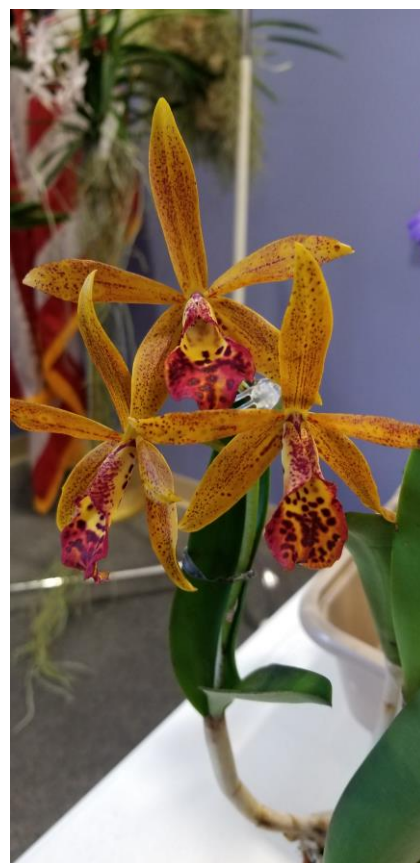
Bc Rustic Spots