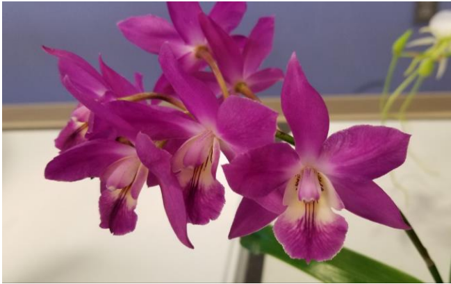
Wlc. Tropical Snowflake

And a few more of Roger's August 2017 Show and Tell Plants: