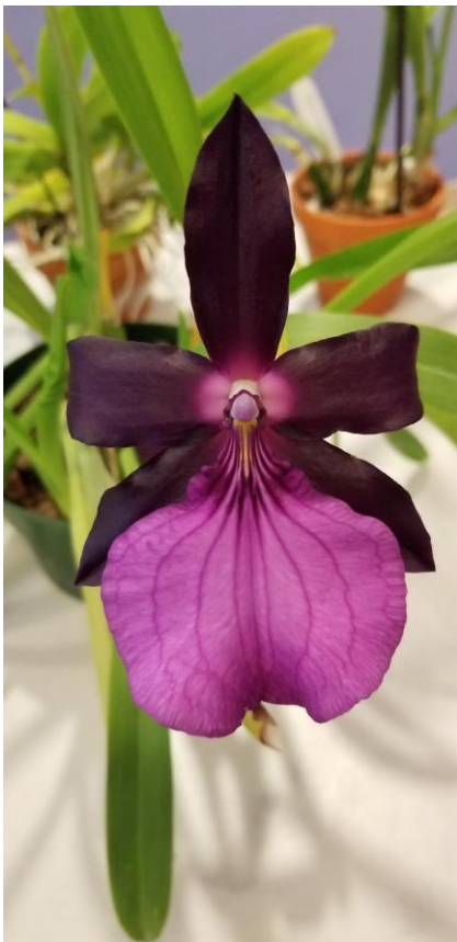
Milt spectabilis var Moreliana