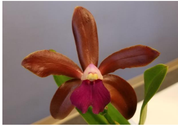
Roger's C. bicolor